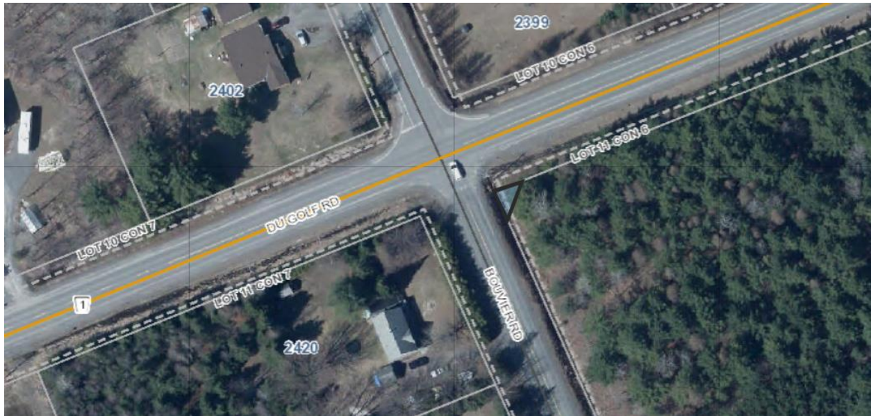
Image 1- Keymap of the location of the sight triangle