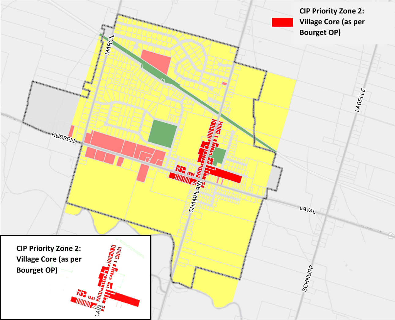
Figure 3. Priority Zone 2 – Bourget Priority Zone Based on Village Core Land Use Designation as per the Bourget Official Plan