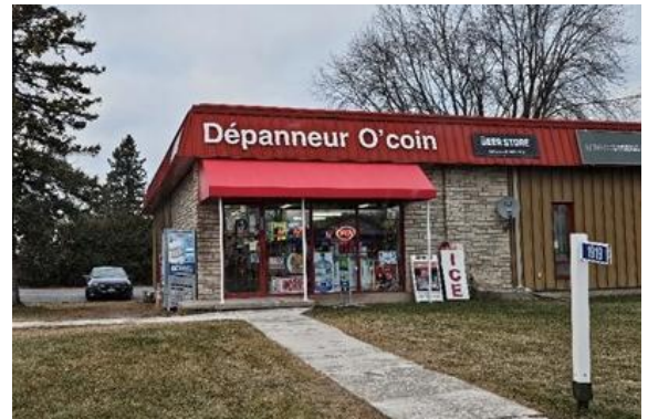
Clarence Creek: Commercial Store Front