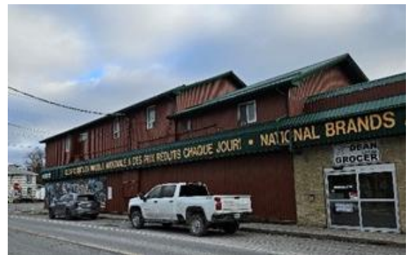
Bourget: Significant Building and Local Retail Hub