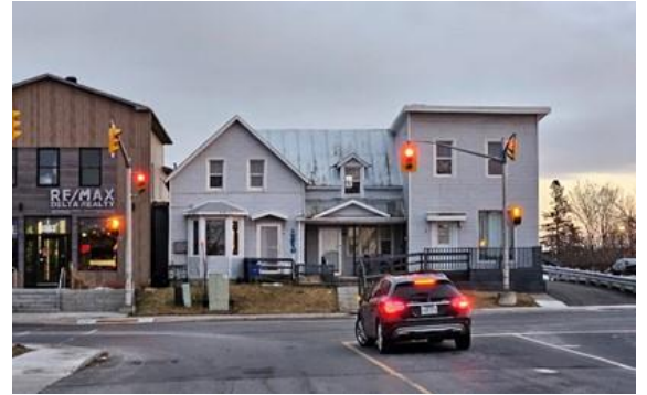
Rockland: Commercial Core Area