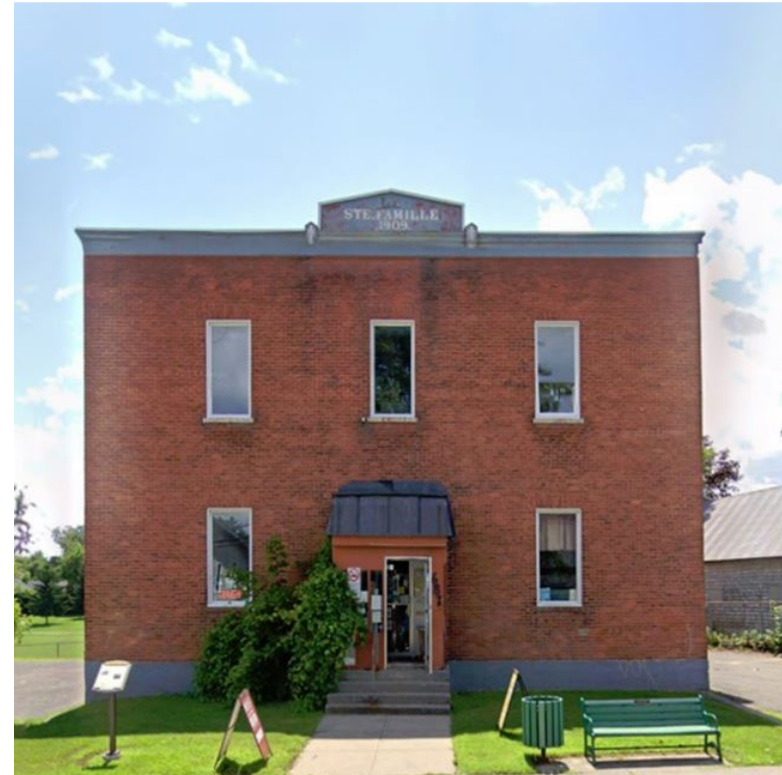
The Clarence-Rockland Museum

The Museum is reinventing itself and pursuing initiatives to better support the fast-growing city's objectives of community cohesion. In 2024, the City engaged Lord Cultural Resources, a specialist